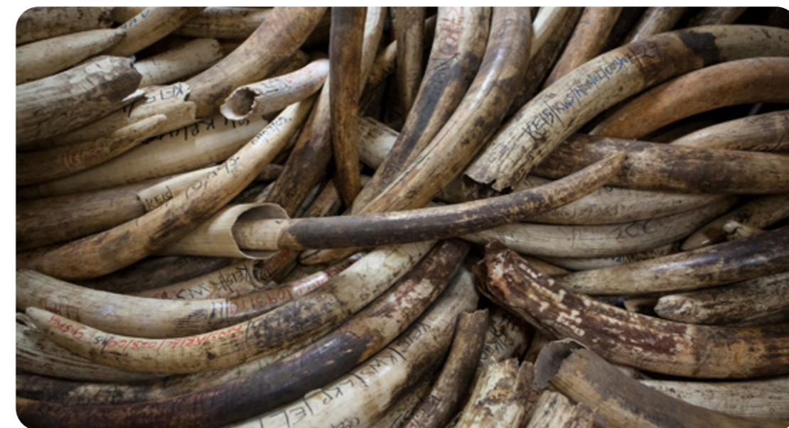
◀ KWS Ivory stockpile, Kenya, Martin Middlebrook

All of these drivers and underlying causes impact Africa's elephants, but it is the illegal killing of elephants for the international ivory trade that led to a dramatic overexploitation of the species, and which still threatens their long-term survival. However, during the past decade, the loss of habitat has arguably eclipsed poaching as the most important threat to elephants. Due to a rapidly growing human population and economic growth, settlements and related infrastructure are expanding, and wildlife habitat is being converted to agricultural land or grazing pastures for livestock. Elephant migration routes are being cut, dispersal areas fragmented, and connectivity lost. As people and elephants compete for land and dwindling natural resources, human-elephant conflict (HEC) has escalated, sometimes resulting in the death or injury of people and in retaliatory killing of elephants.